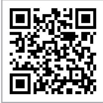
Scan for Registration