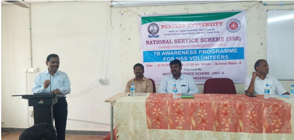
NSS Pos Meeting (28.08.2019)