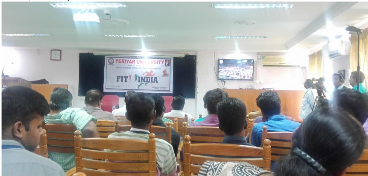
NSS Pos Meeting (16.09.2019)