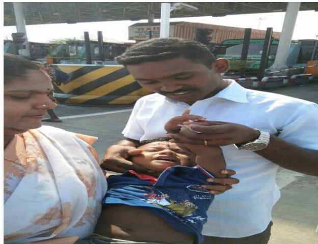
NSS-PU volunteers participated in the pulse polio programme