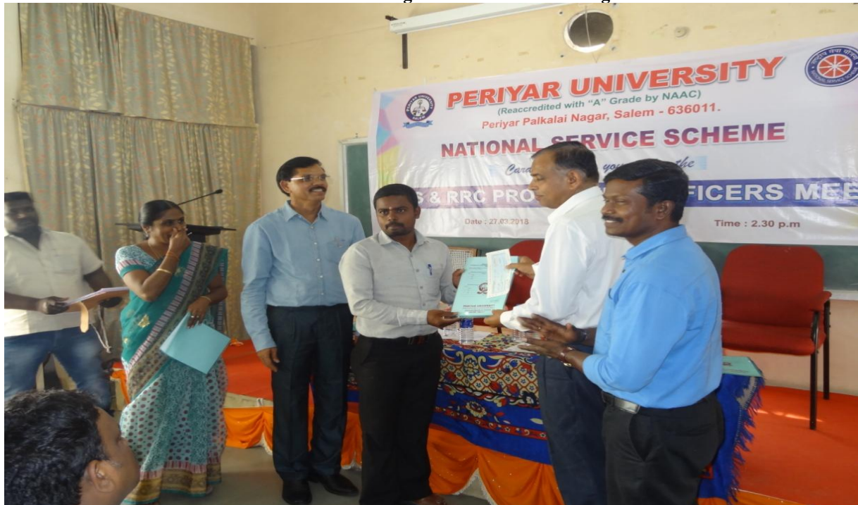
27.03.2018 NSS Programme officer's Meeting