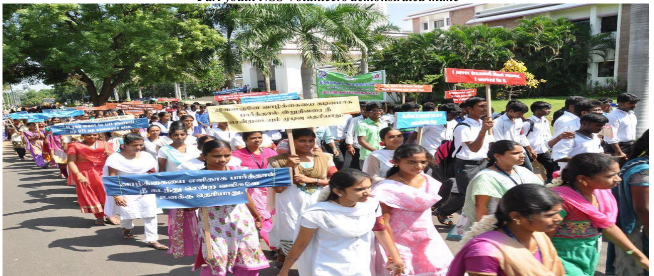
NSS –PU Volunteers took part in the international youth day