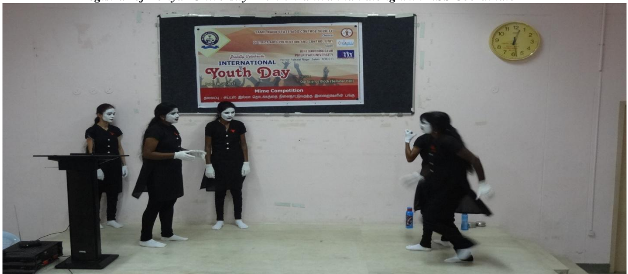
Part youth NSS Volunteers demonstrated mime