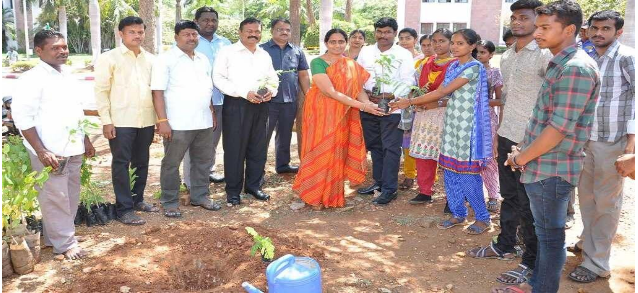
Registrar and Controller of Examinations of Periyar University initiated the tree plantation

Working towards the noble cause to control global warming, enrich greenery and ecological balance, and clean Air pollution of Salem district, Service Scheme (NSS-PU) in association with Department of Environmental Science, organized a Tree Plantation Campaign from June 15th –, 2017 at Periyar University. The objective of this campaign was to create awareness about environment and with the theme of 'Adopt a tree, One Person- One Tree.' The drive aimed to involve all the students of the campus to adopt a tree so that maximum planted tree will survive and sustain.