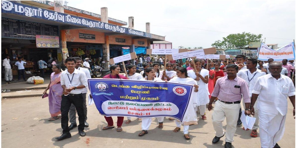
NSS volunteers create awareness about dengue fever in Omalur Town Salem district