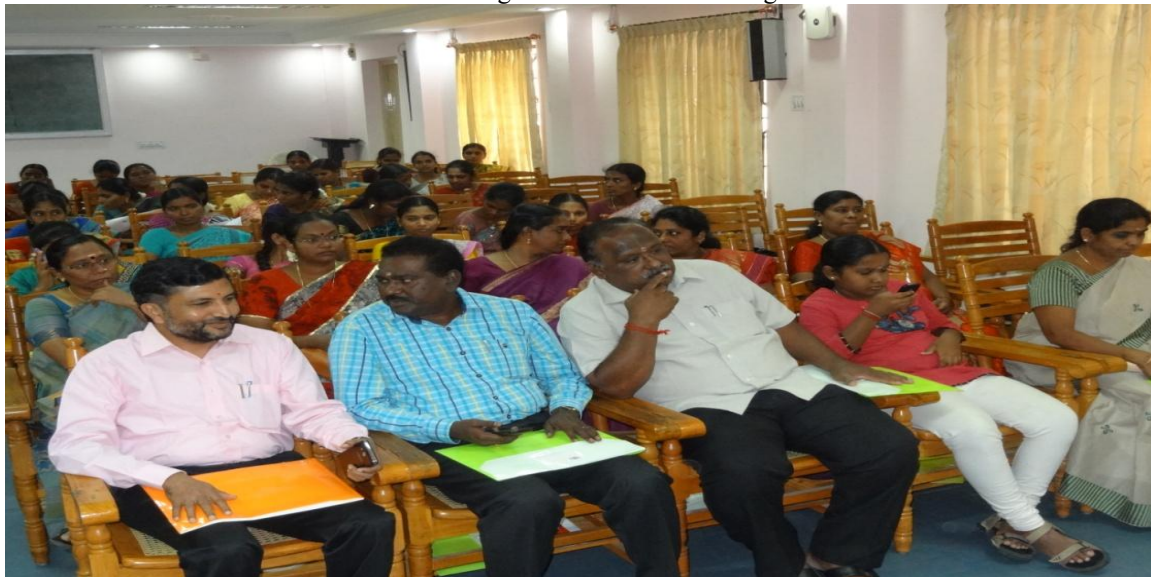
19.07.2017 NSS Programme officer's Meeting at Senate Hall

Working towards the noble cause to control global warming, enrich greenery and ecological balance, and clean Air pollution of Salem district, Service Scheme (NSS-PU) in association with Department of Environmental Science, organized a Tree Plantation Campaign from June 15th –, 2017 at Periyar University. The objective of this campaign was to create awareness about environment and with the theme of 'Adopt a tree, One Person- One Tree.' The drive aimed to involve all the students of the campus to adopt a tree so that maximum planted tree will survive and sustain.