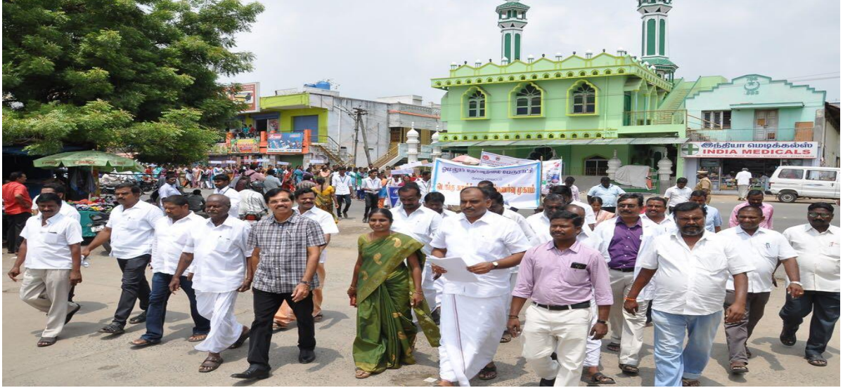
Thiru. Vettri Member of Legislative Assembly M. L. A Omalur Constituency flagged off the rally

A large number of NSS Volunteers participated in a dengue awareness rally organized by NSS Units Periyar University, Salem. Thiru. Vettri Member of Legislative Assembly (M. L. A) Omalur Constituency flagged off the rally from Omalur town main city and speaking on the occasion he said that the students can play a vital role on creating awareness among the public on the need for destroying the mosquito breeding sources. NSS Volunteers handed over pamphlets and stickers to the public and door to door.