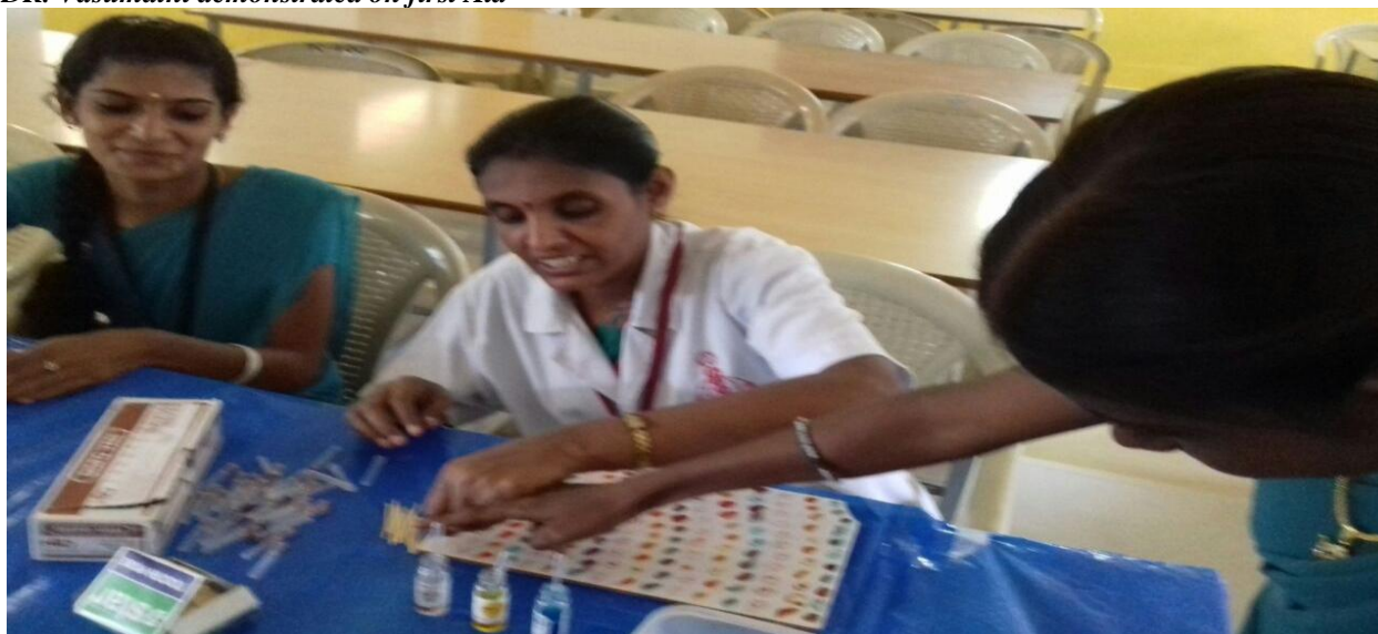
Blood tested the students