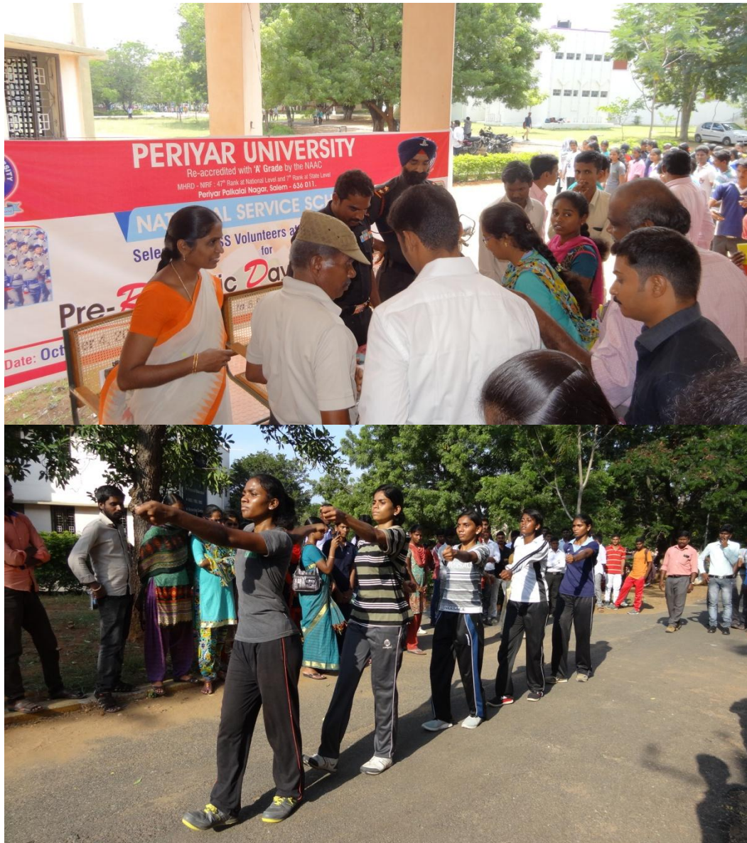
National Unity Day Celebration: Run for Unity Sardar Vallabhbhai Patel – The Unifier of India (31/10/2017)

National Unity Day or Rashtriya Ekta Diwas is celebrated on 31st October every year since 2014 to commemorate the birth anniversary of Sardar Vallabhbhai Patel.