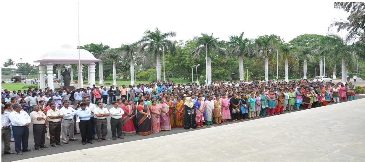
Periyar University staffs and students are attended on National Unity Day Celebration

In 2014, the official statement from the Home Ministry of India stated that National Unity Day “will provide an opportunity to re-affirm the inherent strength and resilience of our nation to withstand the actual and potential threats to the unity, integrity and security of our country.”