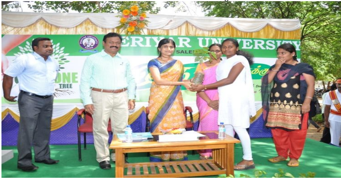
15.09.2017 Mass Tree Plantation Programme