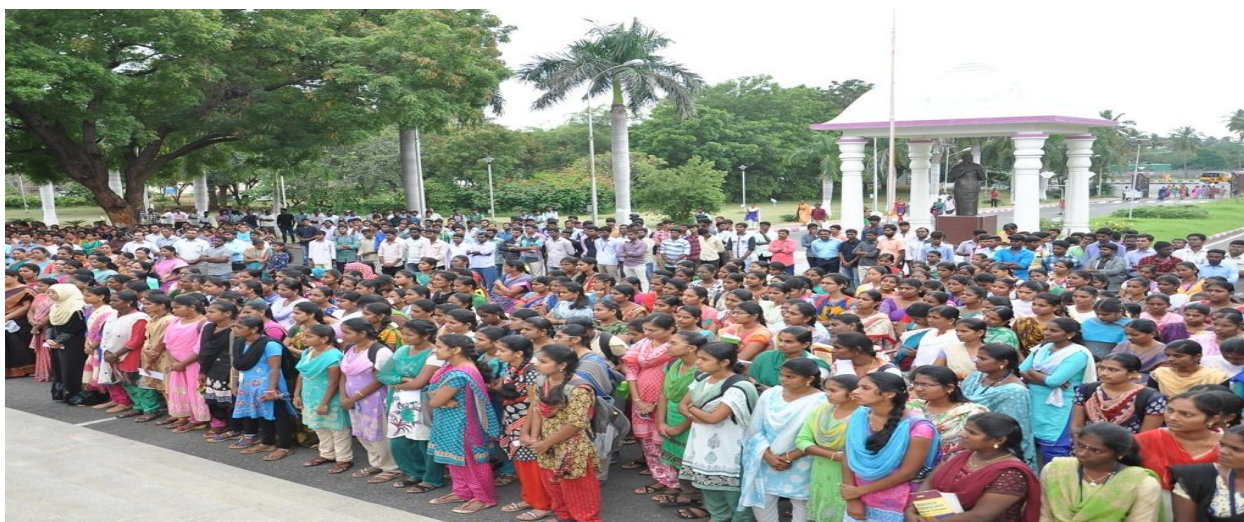
Periyar University staffs and students are attended on National Unity Day Celebration

“I solemnly pledge that I dedicate myself to preserve the unity, integrity and security of the nation and also strive hard to spread this message among my fellow countrymen. I take this pledge in the spirit of unification of my country which was made possible by the vision and actions of Sardar Vallabhbhai Patel. I also solemnly resolve to make my own contribution to ensure internal security of my country.”