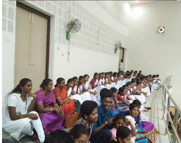
NSS-PU Volunteers taking part in the Sister Nivedita's function