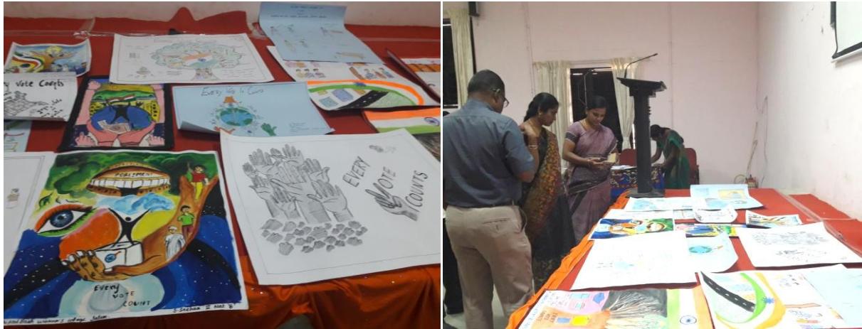
National Voter's Day Competition for NSS Volunteers